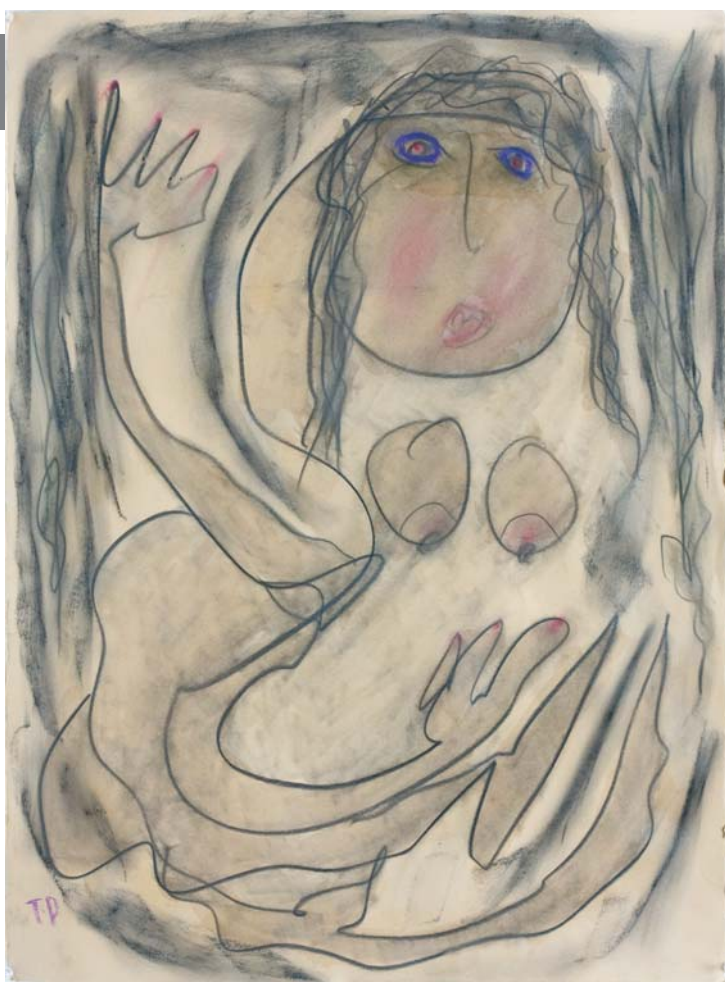
Thornton Dial (b. 1928) Leaving the Shadows , 2008 Graphite, pastels, coffee on paper 30 x 28 inches