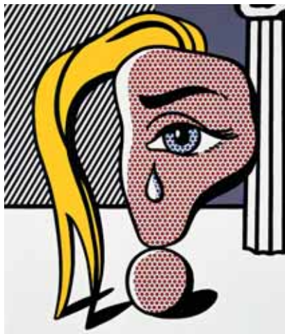
Roy Lichtenstein (1923–1997), Girl with Tear III , 1977. Oil and magna on canvas, 46 x 40 inches.