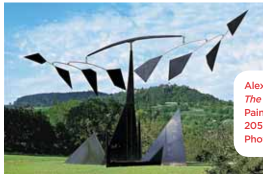
Alexander Calder (1898–1976), The Three , 1966. Painted steel and aluminium, 205 x 421¼ inches.