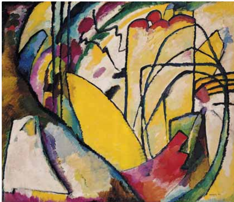
Wassily Kandinsky (1866–1944), Improvisation 10 , 1910. Oil on canvas, 47¼ x 55 inches.