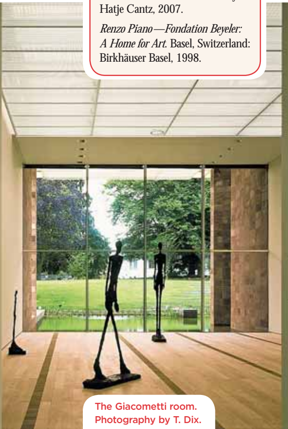
The Giacometti room.

Renzo Piano— Fondation Beyeler: A Home for Art . Basel, Switzerland: Birkhäuser Basel, 1998.