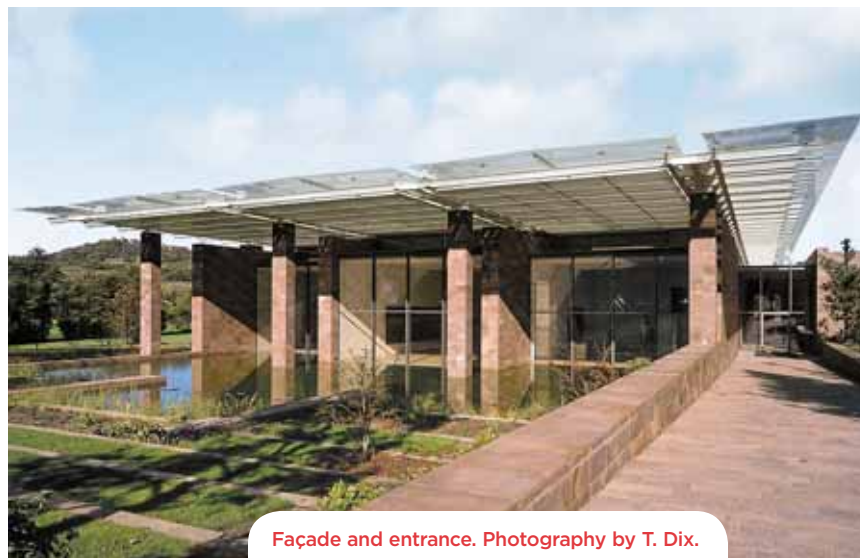
Façade and entrance.